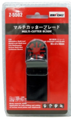
Z-5502 STANDARD STRAIGHT SAW BLADE