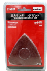
Z-5801 SANDING PAPER SET RED (5PCS)