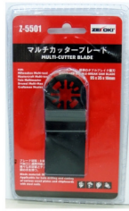
Z-5501 STANDARD DOUBLE -BREAK SAW BLADE