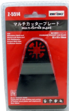
Z-5514 STANDARD STRAIGHT SAW BLADE