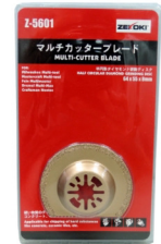
Z-5601 HALF CIRCULAR DIAMOND GRINDING DISC