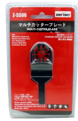
Z-5506 STANDARD STRAIGHT SAW BLADE