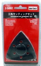
Z-5802 SANDING PAPER SET GREY (5PCS)