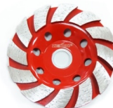
ZKK-DGWT-105P 100x5x20/16mm Segmented Turbo Cup Wheel