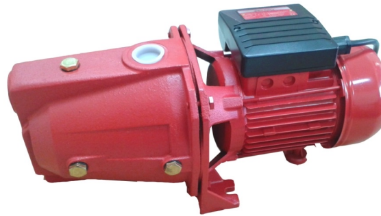
SELF-PRIMING PUMP (STAINLESS IMPELLER)