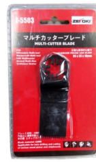
Z-5503 STANDARD PRECISE SAW BLADE