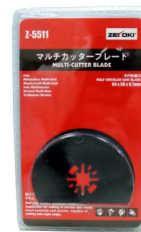
Z-5511 HALF CIRCULAR SAW BLADE