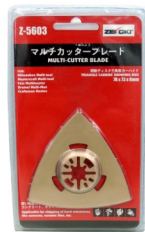
Z-5603 TRIANGLE CARBIDE GRINDING DISC