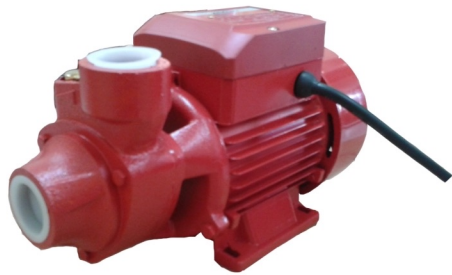
CLEAN WATER PUMP (BRASS IMPELLER)