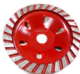
ZKK-DGWT-105 100x16mm Turbo Cup Diamond Wheel