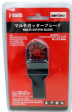
Z-5505 STANDARD STRAIGHT SAW BLADE