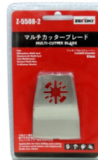
Z-5508-2 FLEXIBLE SCRAPER