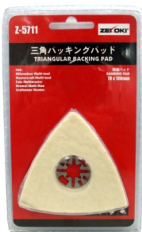
Z-5711 TRIANGLE SAND DISC WITH ALUMINUM BOTTOM