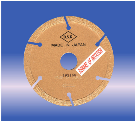
Dry Type Segmented Diamond Cutting Wheel