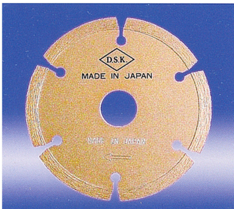
Dry Type Segmented Diamond Cutting Wheel