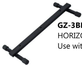
GZ-3BR HORIZONTAL BAR Use with GZ-3 series