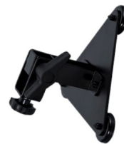
GZ-3MB MAGNETIC BASE Use with GZ-3 series