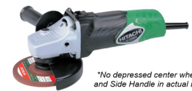
*No depressed center wheel and Side Handle in actual unit