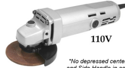
*No depressed center wheel and Side Handle in actual unit