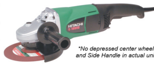
*No depressed center wheel and Side Handle in actual unit