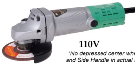
110V *No depressed center wheel and Side Handle in actual unit