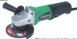
*No depressed center wheel and Side Handle in actual unit