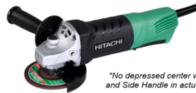
*No depressed center wheel and Side Handle in actual unit